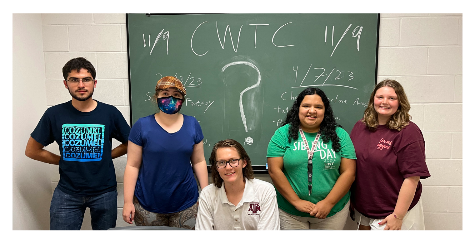
Pictured above: Members of the CWTC gathered in Evans Annex 239 for their weekly meeting. Join them Wednesday nights from 7:30-8:30, and follow their Instagram account @cwrtctamu for updates on meetings and other events.

fluence and understand how your audience reads it are all skills that transcend writing, and train someone to become a better human being.