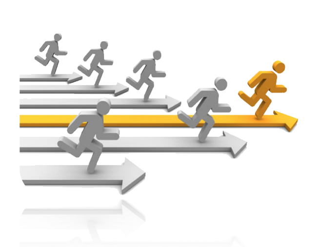
TAMU I-O Psychology continues to be highly ranked.

I-O Psychology program rankings based on graduate student perceptions of their programs were published in the March 2018 issue of The Industrial-Organizational Psychologist . The Texas A&M I-O Psychology PhD program ranked 4<sup>th</sup> for faculty quality, 6<sup>th</sup> for program culture, and 4<sup>th</sup> overall.